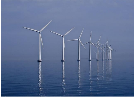
The Middelgrunden offshore wind farm in Öresund, Denmark

vent centrally planned solutions or that only incumbent or large players are able to build the generation. In this sense, Recital (43) of the Directive 2009/72 states: “[n]early all Member States have chosen to ensure competition in the electricity generation market through a transparent authorisation procedure”.